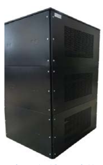
Customized Battery Cabinet