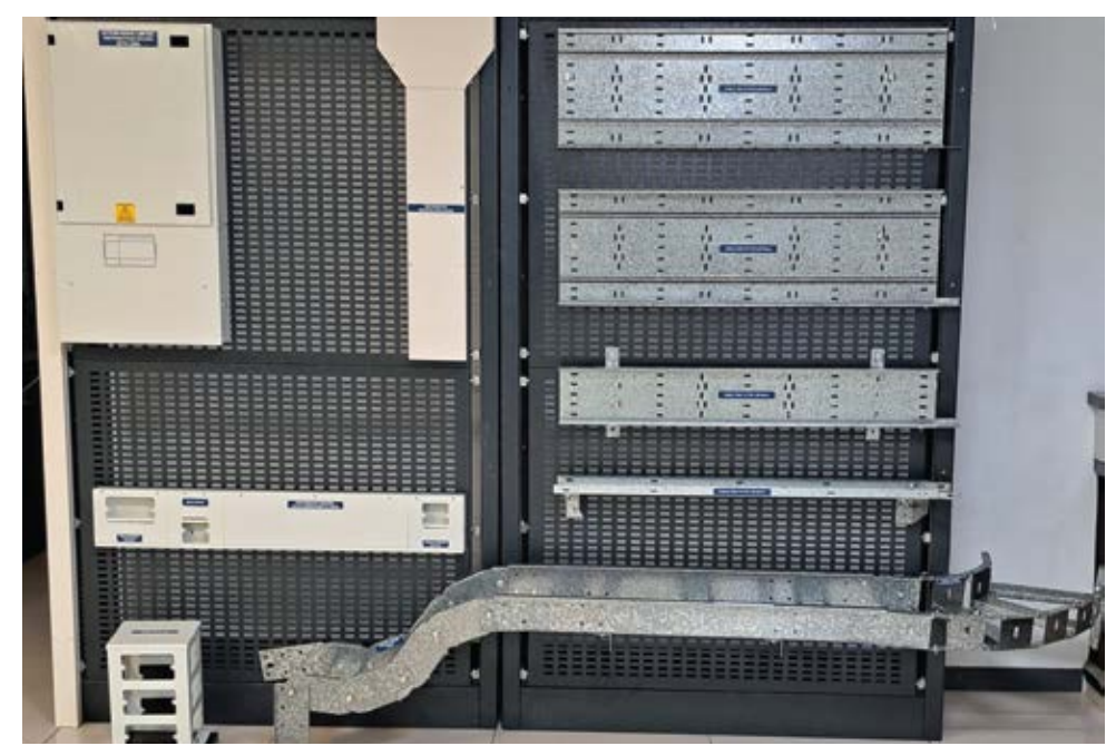
Cable Management Solutions

Our comprehensive range of Cable Management Solutions, are meticulously designed to meet the highest standards of quality, functionality, flexibility, and ease of installation.