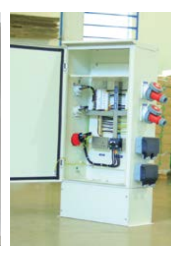
Purpose Made Enclosures