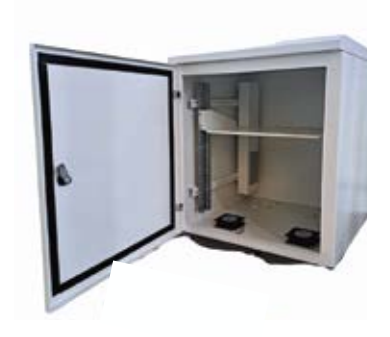
Outdoor Pole Mounted Data Rack